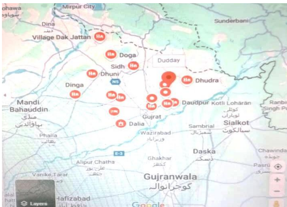
Figure 1: Study area (Dudday Village, District Gujrat)